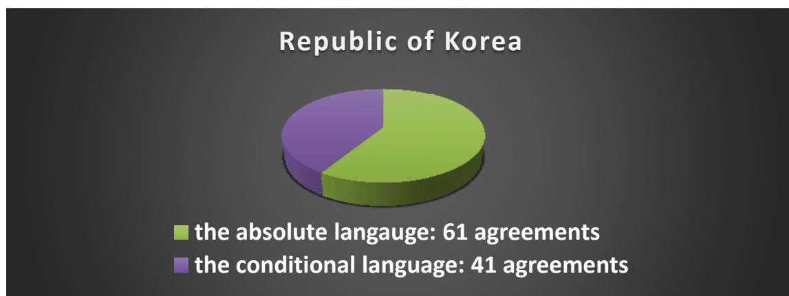
Figure 1. The model of languages on IP rights under the BITs of the ROK

ing charts can show the percentages of every language under the BITs: